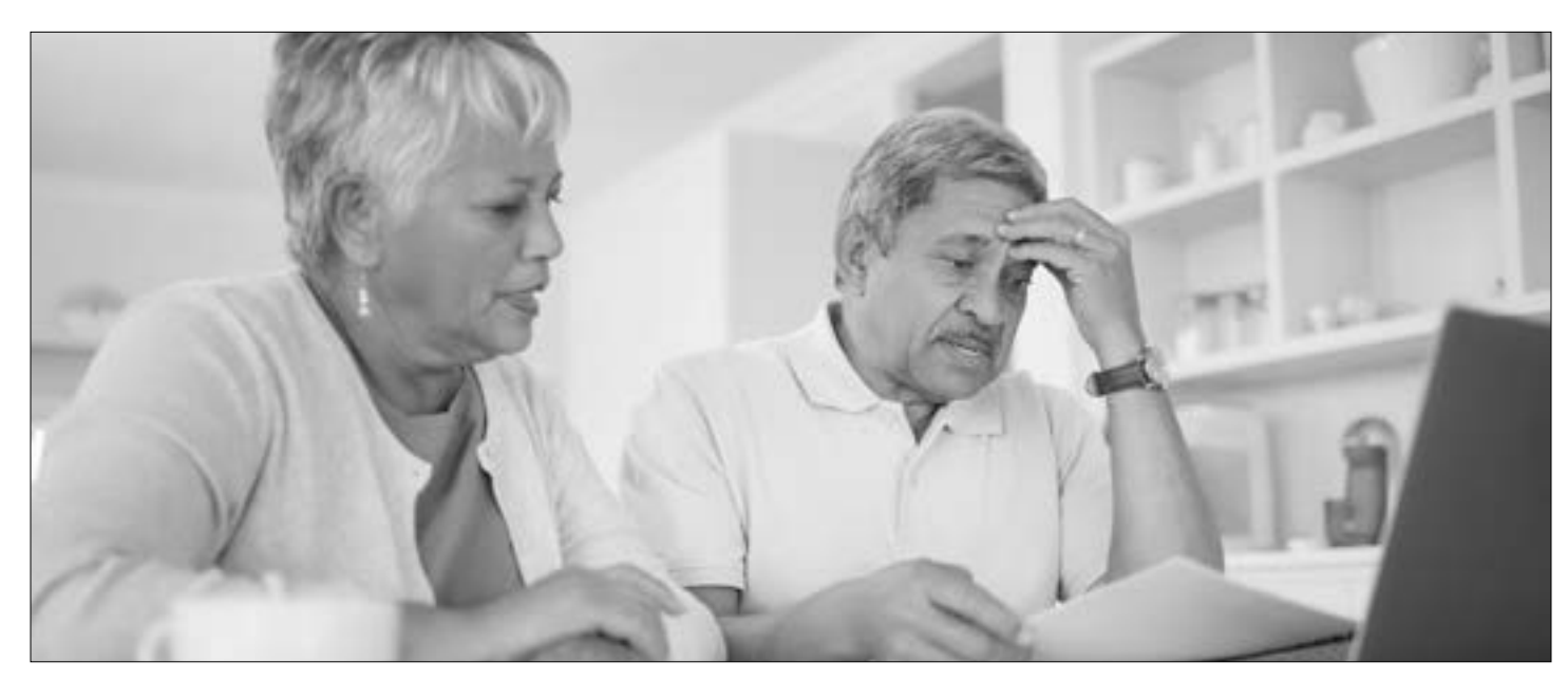
Colorado Property Tax / Rent / Heat Rebate Program