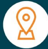
Services in Diverse Settings