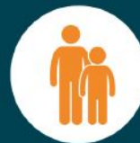
Expansion of Youth Services