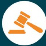
Alternative & Interventions in Criminal Justice